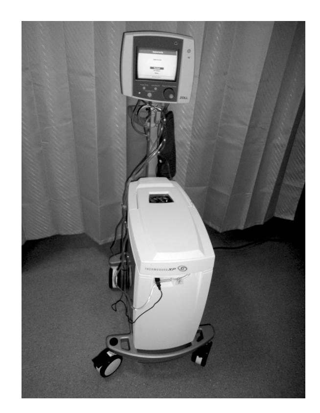
Figure 1. The Alsius Coolgard 3000 cooling device

This device consists of a temperature control system comprising as follows: temperature probes; an intravascular heat exchange catheter; a disposable tubing pack to connect the temperature control system; and a catheter (Fig. 1). The system circulates sterile saline in a closed loop to the balloons on the central venous catheter. The catheter has two lumens for circulation of the cooled saline and a third standard lumen (Fig. 2). The blood is cooled as it passes the membranes. The core temperature is continuously monitored via a urine catheter probe and any change results in feedback to the machine which, in turn, regulates the temperature of the saline. The operator sets the target temperature and rate of cooling.