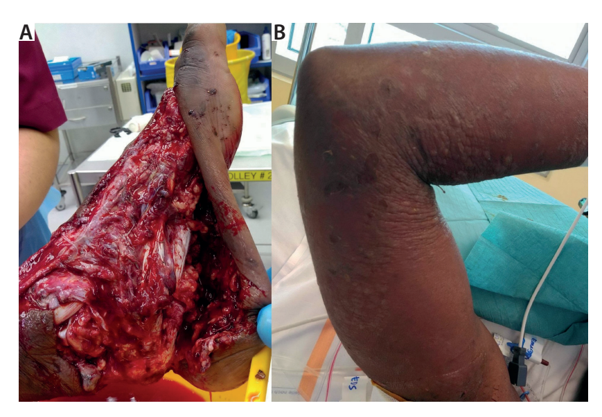
FIGURE 1. A) Degloving injury. B) Vesicular rash, erythema, and sloughing

Received: 08.03.2024, accepted: 17.01.2025